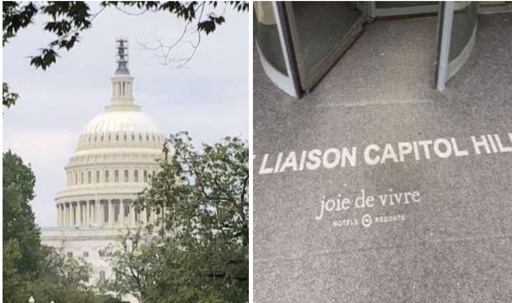
“THE MORE WE KNOW...”

The 14 th Annual Meeting of the National Alliance of State Prostate Cancer Coalitions was held in Washington, D.C. on Capitol Hill from October 12 through noon on October 14, 2018. As always, state prostate cancer organizations, including state coalitions, associations, foundations and other organizational entities, were represented by at least one leader, sometimes two; and invited guests also attended. Sponsors of the Annual Meeting sent representatives to participate or speak, network and share information; they were also invited to bring their materials for the tables. There were over 14 Sponsors who helped support the 14 th Annual Meeting.