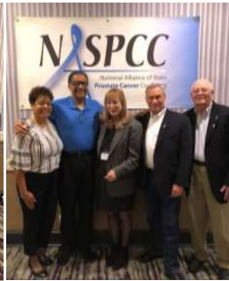
2018/2019 NASPPC Board of Directors and Executive Committee Members